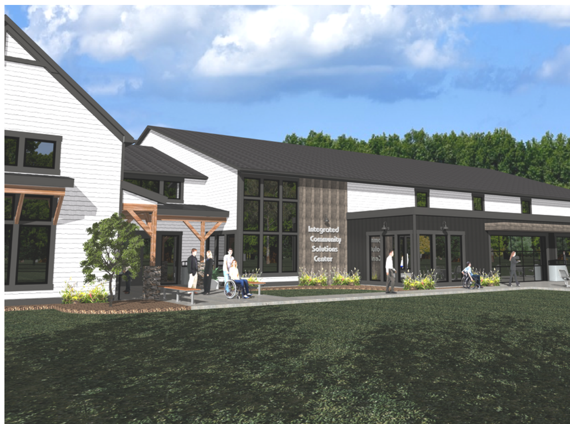
Shown above are concept renderings of Autumn Bridge Crossing's planned 1-, 2-, and 3-bedroom for-sale homes and 10,000sf Enrichment Center which will be a resource for our residents and individuals with and without developmental disabilities from the surrounding communities.